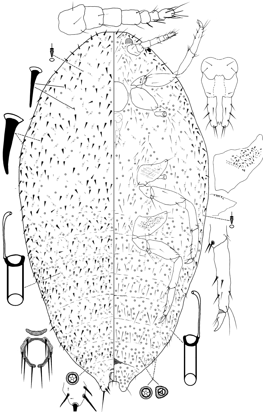
Figure 2. Neoacanthococcus atlihani Kaydan & Kozár sp. nov. 2010.