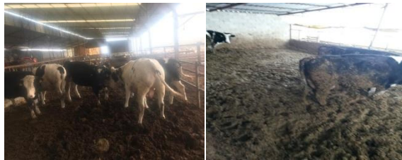
Figure 2. Unclean cattle barns