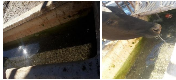
Figure 1. Water troughs for cattle.

Several factors affect the cleanliness conditions of the cattle. These factors can be classified as air humidity, type of housing, material and construction of the floors, stall dimensions, use and amount of bedding, manure consistency, maintenance of the floors and cleaning of the animals (Ruud et al., 2011; Hauge et al., 2012). Silage is one of the potential contamination sources in cattle barns (Driehuis, 2013). Kymäläinen and Kuisma (2014) observed that the feeding troughs and drinking bowls were rather highly contaminated due to the contact with animals and silage. In the study, where the analysis of the water samples taken from the drinking waterlines of cattle barns, some values were observed to be much different from each other. The main and apparent causes of the differences are the current state of drinking water net in the enterprise and their possibility of being affected by different organic substances such as animal wastes. However, the secondary causes for drinking water pollution may be different, variable and be specific in any enterprises. Therefore, cattle barn hygiene conditions should be checked continuously and periodically, and necessary analyzes should be performed (Erkan Can, 2019). In the scope of the project where animal drinking water quality was investigated in Adana, Turkey, the images taken from cattle troughs are shown in Figure 1.