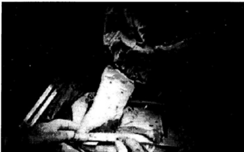
Figure II. The modified Tubbs dilator introduced via a port in 6th intercostal space.