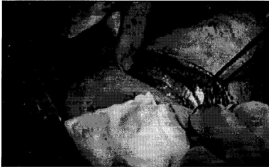
Figure 1: Left anterior mini thoracotomy performed with TEE guided CMC. Note that the incision is much more smaller than the classical anterolateral thoracotomy.

area was reached. Throughout this procedure, TEE was performed. Echocardiographic values also were measured following procedure (Figure 1, Table II).