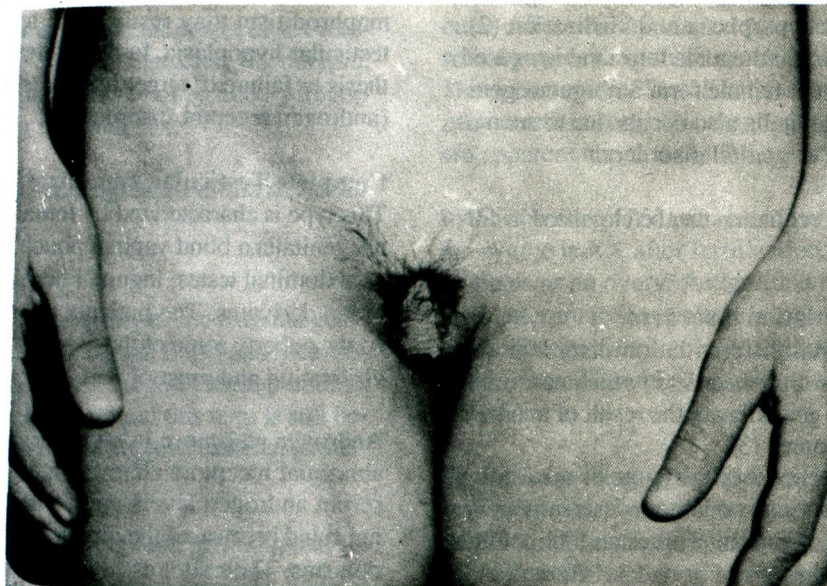
Fig. 1: Femal pseudohermaphrodite

Hormonal Analysis: Hormon levels of the two true hermaphrodites were normal. 2 female pseudohermaphrodites had low plasma cortisol level and incre-