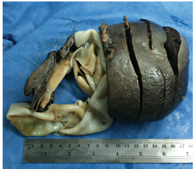
Figure 2: The splenectomy specimen including hydatid cyst and germinative membrane.

As a result, in the differential diagnosis of splenic cystic masses, hydatid cysts take the first place especially in endemic regions like Turkey. Patients may have no complaints until the cyst reaches an advanced size hindering the diagnosis, or patients may consult a doctor after facing complications as well. Radiological methods are important in diagnosis. The treatment of a splenic hydatid cyst is surgery and the type of surgery varies