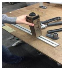
Figure 4: An Example of Apparatus to be equipped on Preliminary Assembly Workbench

In preliminary assembly atelier, many processes such as drilling, expansion of the hole are carried out on preliminary assembly workbench. During these processes, burrs are formed and accumulated on this workbench. Painted bars are scratched and damaged because of these burrs on the workbench while preliminary assembly processes are occurred and this situation causes re-painting of the scratched bars. A potential solution suggestion for this situation is to rearrange the workbench with an adjustable apparatus as shown in Figure 4 in order to prevent the contact the surface of bars with burrs. Thus, excessive labours arising from re-painting operation will be eliminated. Also, it is foreseen that the rate of non-conforming bars is decreased by 3% in the quality control mechanism after preliminary assembly operations. This adjustable equipment may be produced in the part-production atelier, therefore this solution suggestion offers a cost-effective way.