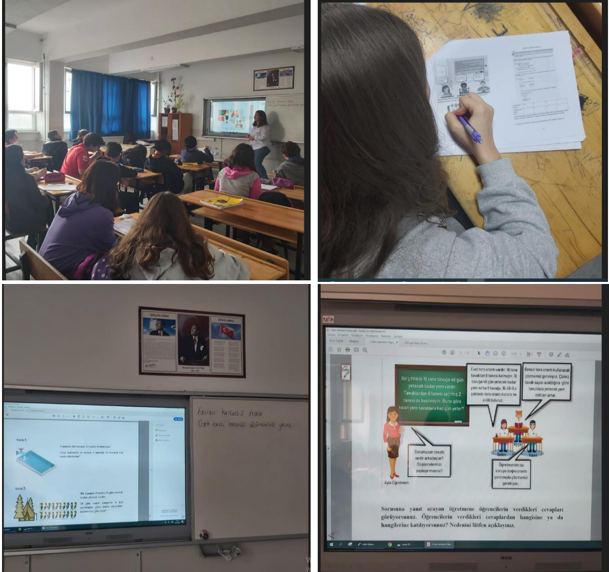
Figure 1. Photos from the Implementation in EG

lessons as an observer. The activities prepared using concept cartoons according to the 5E learning model were projected using a Smart Board in the classroom. Cartoons' print-outs were distributed to students. A total of 35 concept cartoons were prepared to use at each stage of the model. Researchers generated concept cartoons on the Canva program, a free educational program used by teachers and students worldwide ( https://www.canva.com/tr_tr/ ). They prepared concept cartoons using cartoon templates consistent with their objectives. During the preparation of the cartoons, attention was paid to possible copyright infringements and the features a concept cartoon should have. The prepared concept cartoons were presented to the experts, errors such as spelling mistakes and insufficient font size were corrected, and the cartoons were finalized. Photos from the implementation in EG are shown in Figure 1.