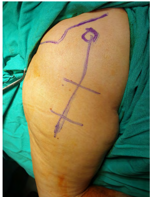
Figure 1: Incision site

ss; standard deviation, Test; Significance Test Value of the difference between the two means, * p < 0.05 . There is a statistically significant difference between the groups.