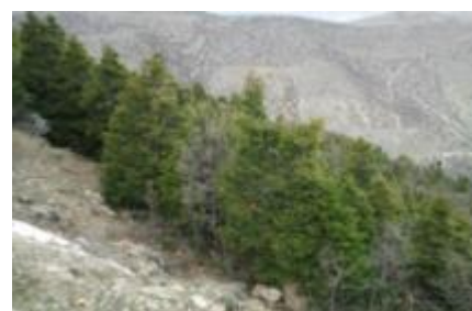
Figure 2. General views from the Taurus fir stand (Dağdelen and Keleş, 2012)

Terrestrial climate is dominant in Central Anatolia. The climate type is determined by the 22-year measurement data of Develi Meteorological Station which is the nearest station to the area at 1,180 m. The area has a semi-arid climate according to de Martonne Index (1942). Monthly average temperature is between -0.8 °C to 29.2 °C where the annual average temperature is 16.8 °C. Monthly average