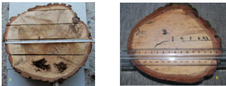
Figure 4. Fir stem cross-sections (Keleş, 2012)

Soil samples were obtained from two different altitudes (1,670 and 1,545 m) in order to define the soil structure of the area. The soil has medium texture and low amount of organic material, it is sandy loam-clay loam, slight-medium alkaline, and salt-free according to the laboratory results (Anonymous, 2012). There is a 3-5 cm litter-humus layer on the soil surface (Figure 5a). The fixed depth is measured as 50 cm in the first soil profile (1,670 m) and 60 cm in the second soil profile (1,545 m). The effective rooting depth is determined as 70 cm and 90 cm, respectively. The deep fractured