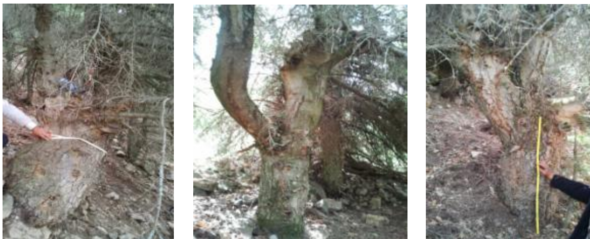
Figure 6. Irregular cuts in the thick diameter trees (Keleş, 2012)