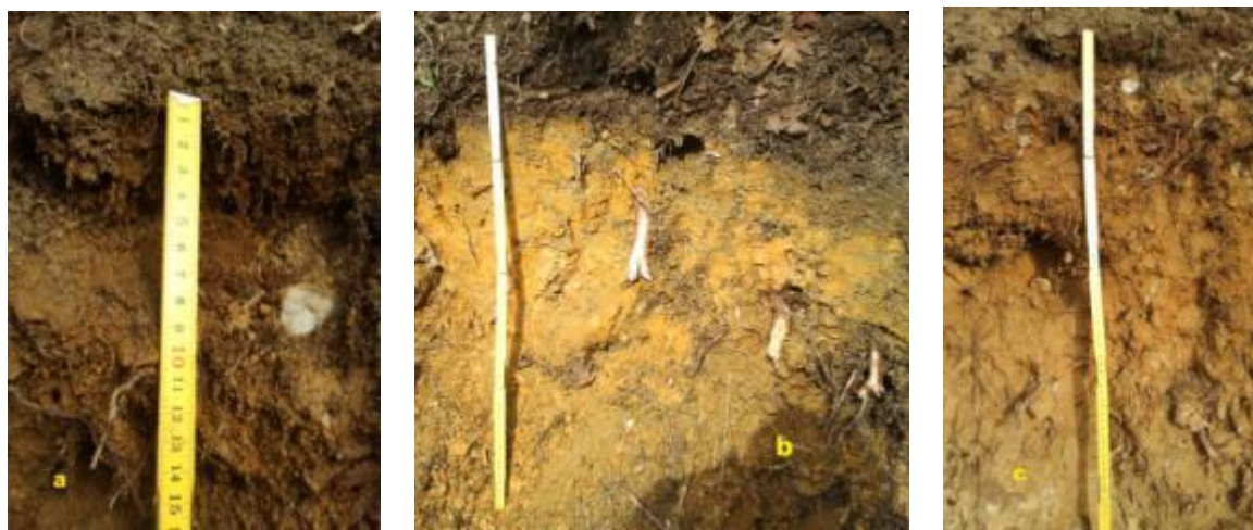
Figure 5a-b-c. Humus layer - litter and root distributions into the soil (Keleş, 2012)

The root of the trees spread in 0-50 cm depth in the first soil profile (1,670 m), while they spread in 0-60 cm depth in the second soil profile (1,545 m). After these depths (60 cm) no root spread is observed. This indicates that the effective rooting depth is shallow (Figure 5b and 5c).