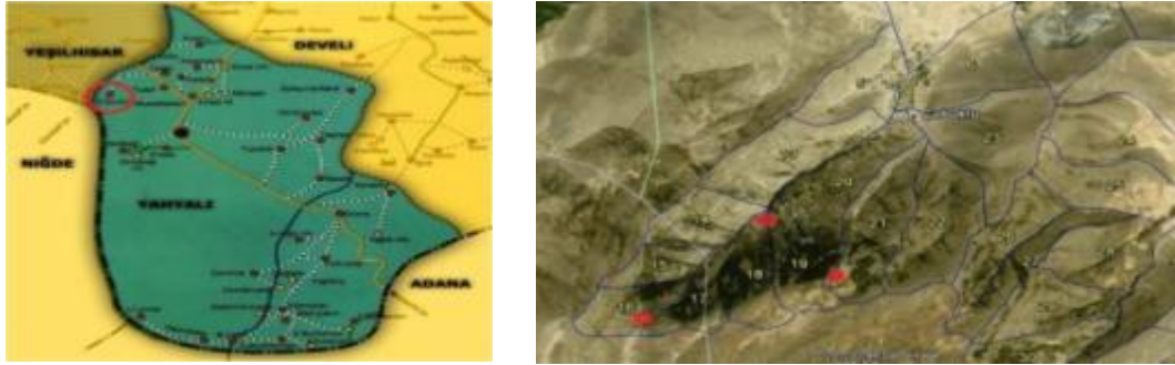
Figure1. Maps showing the range of the new Taurus Fir area (Dağdelen, 2012)

This area remains in B5 square according to Davis’s grid system (Davis, 1965). This new range of Taurus Fir is localized in the coordinates of 38°07'27"-35°13'59", 38°07'52"-35°15'40" and 38°08'19"-35°15'13" (Figure 1).